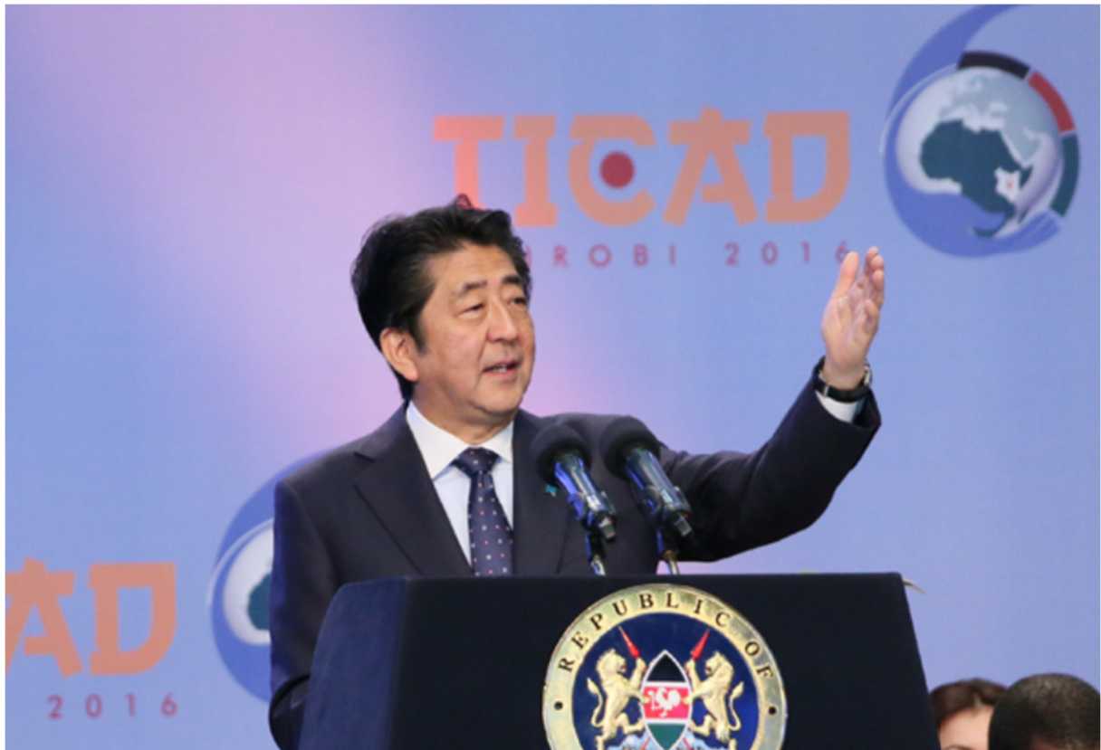
Prime Minister Abe speaks at the opening session of TICAD VI in Nairobi, Kenya, August 27, 2016.

Prime Minister Abe responded, “As pointed out, the spread of COVID-19 is leading to various discussions about new social changes in the world. In the post-coronavirus world, it will be important for us to have a firm vision about the future maritime order.”