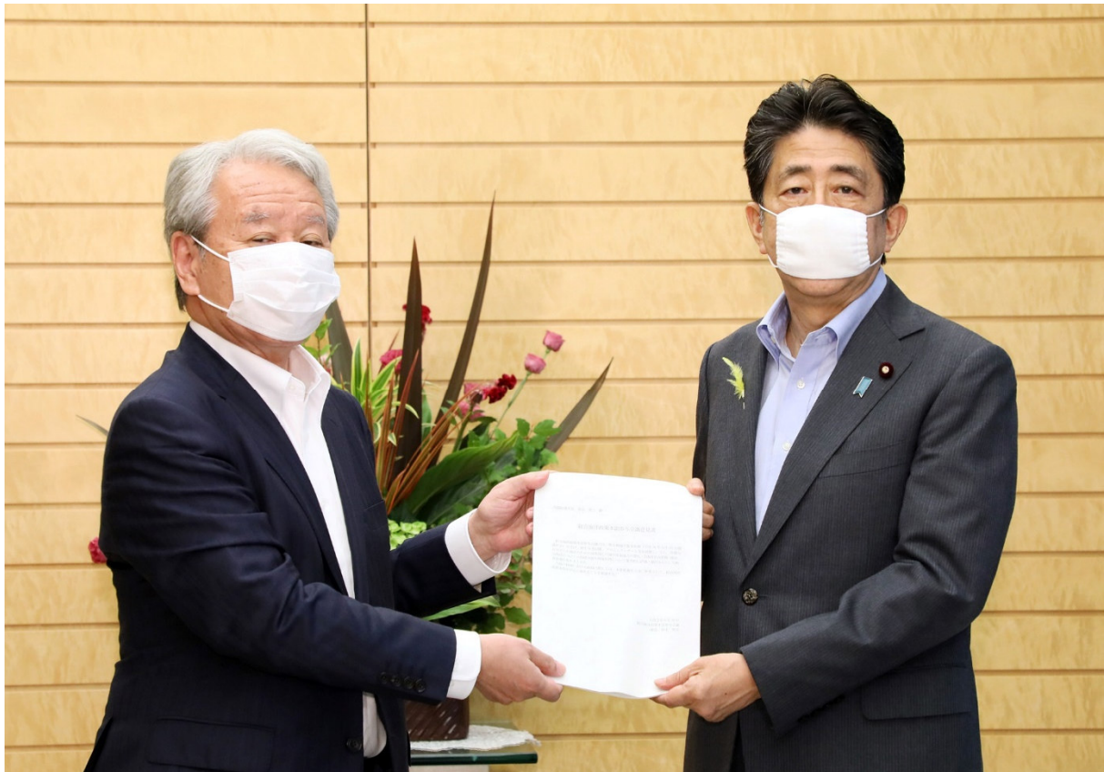
Prime Minister Abe receives the recommendations of the Councilors’ Meeting of the Headquarters for Ocean Policy from Chairman Tanaka Akihiko, June 30, 2020.

In response to the 3rd Basic Plan on Ocean Policy, the Councilors’ Meeting of the Headquarters for Ocean Policy set up project teams in September 2019. They put together recommendations after holding focused evaluations and discussions about (1) strengthening ocean industry cooperation and the international competitiveness of the ocean industries with sea-lane countries, (2) strengthening the capacity of Maritime Domain Awareness (MDA), and (3) implementing marine environment protection as part of the Sustainable Development Goals (SDGs) as regards the oceans.